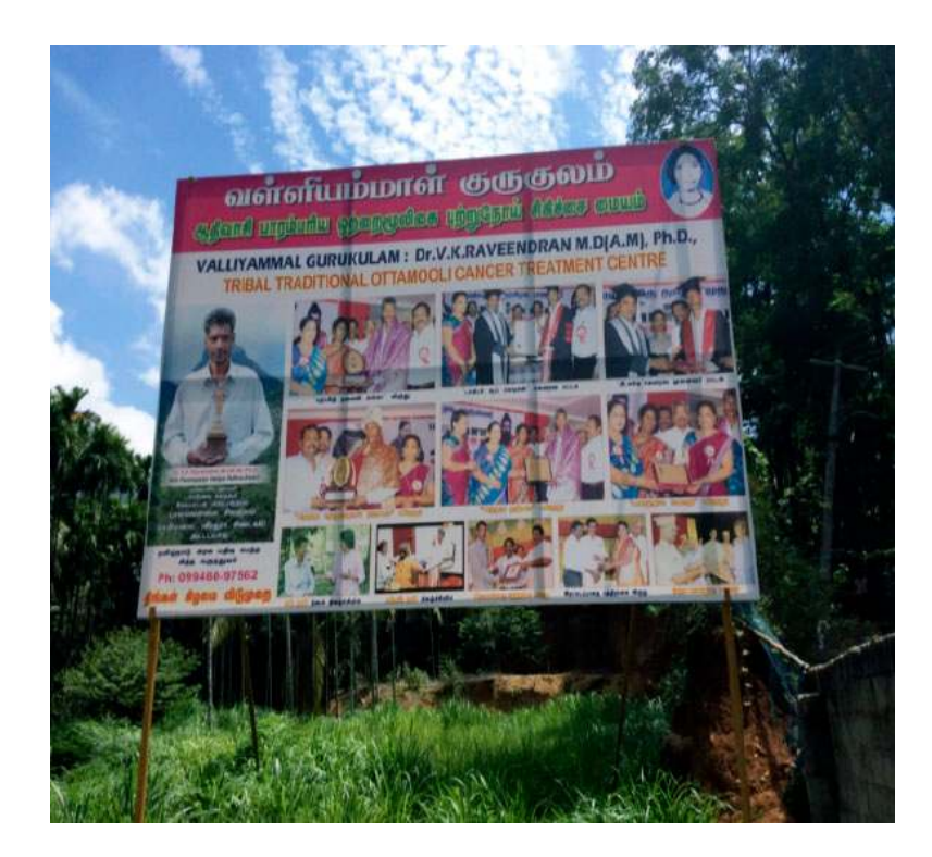
Figure 3: Valliammal Gurukulam.