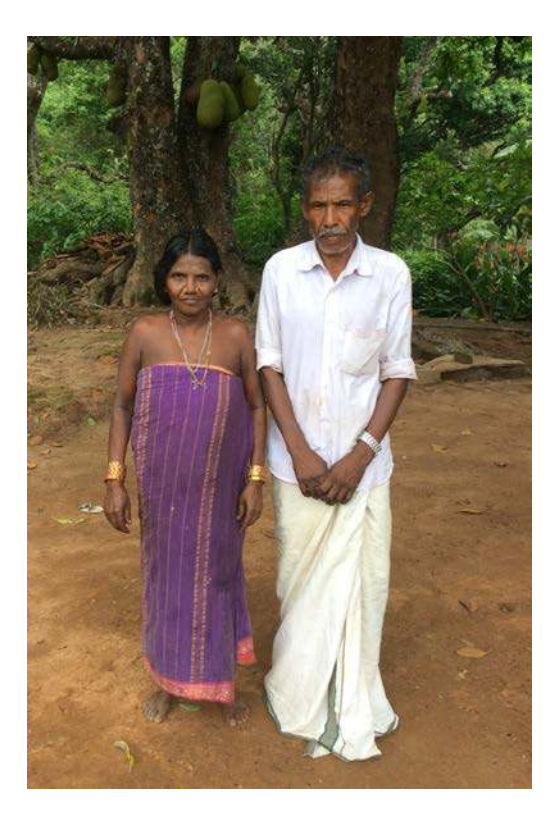
Figure 2: Moopan (village headman) and wife in Anavayi ooru.

A PDS shop usually serves a cluster of villages and the men make long trips to fetch and transport the sacks of rice allotted to them. High on a pass in the Attappady hills in Anavayi village, at the crossroad between the interior Kurumba villages and the main Mannarkad Road that connects them, is a tea house run by the moopan (Figure 2). In between sips of tea and bites of sweet dumplings, deep fried dough sweetened with jaggery (cane sugar), sacks of grain can be seen arranged in the corners of the room. The journey from the PDS to the shops is broken at the tea house and the sacks of grain are taken to the various interior villages in subsequent trips. As swidden cultivation is practiced roughly once in three years, there is increased dependence on rice. As mentioned, swidden may only be practiced in fixed zones allotted by the Forest Department and they have no titles for this land.