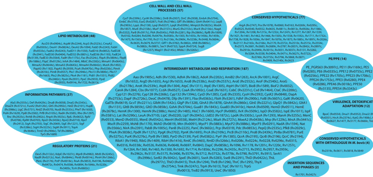
Figure 3 List of Identified Targets. The distribution of the functional classes of the 451 targets identified in the H-List. The number of targets present in each of the functional classes is also indicated.

the targetTB pipeline is given as supplementary material [See Additional file 7].